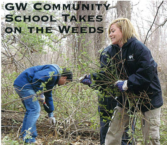
GW COMMUNITY SCHOOL TAKES ON THE WEEDS